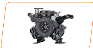
54 lpm Diaphragm Pump