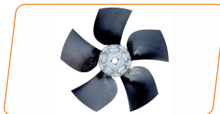
550 mm Diameter fan