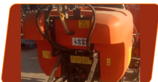
200 liter chemical tank