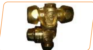
Brass Nozzle with Ceramic tips