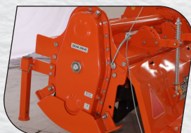
Gear drive side transmission drive