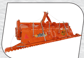
Leveller for better soil finishing