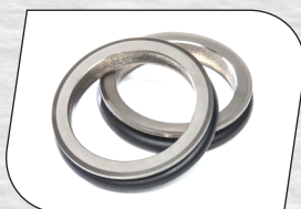
Duo Cone" seals to protect against dust, mud, and water