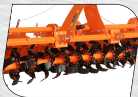
C type Blades