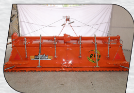
Light in weight & Trailing board adjustment with 4 Nos. Damper spring